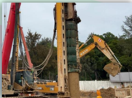
Pre-boring works for subsequent sheet piles installation 鋼板樁預先鑽孔工程