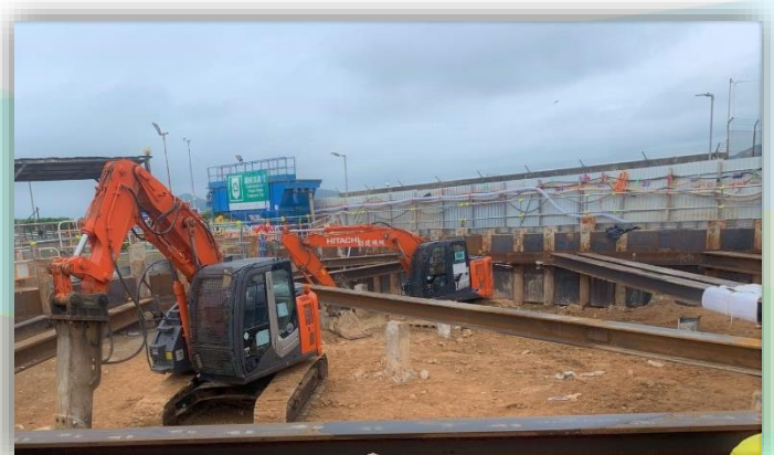
Construction of Excavation and Lateral Support 進行開挖並建造臨時支撐工程